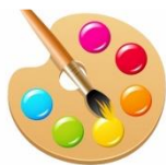
Arts & crafts