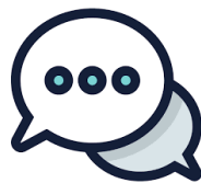
Advice & guidance